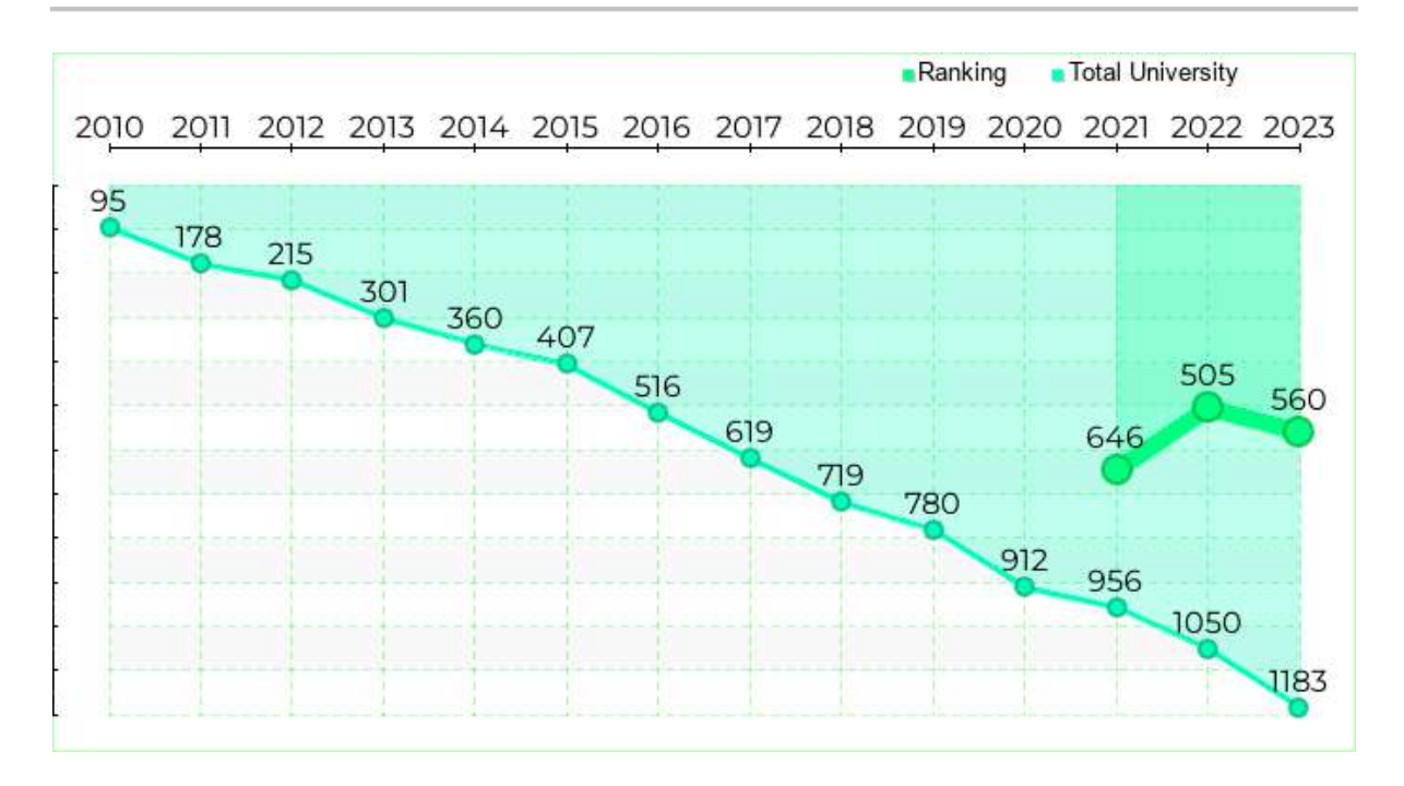
Figure 3.1 World Rankings History Diagram